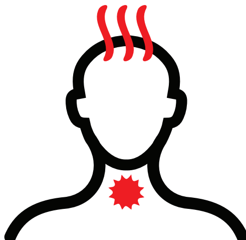
Sore Throat with Fever